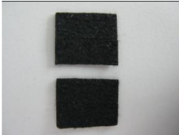
Figure 1. Felt pieces.