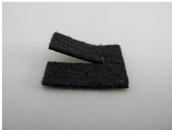
Figure 2. Cutting felt.