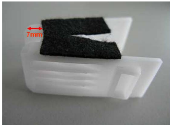
Figure 4. Distance of felt installed from end.