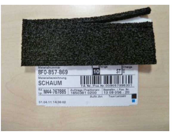
Figure 4. Sealing foam tape.