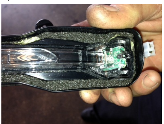
Figure 6. Turn signal lamp with sealing foam tape installed.

6. Exercise care when reassembling the turn signal lamp and side view mirror housing. Incorrect assembly will lead to additional gaps where wind noise can occur.