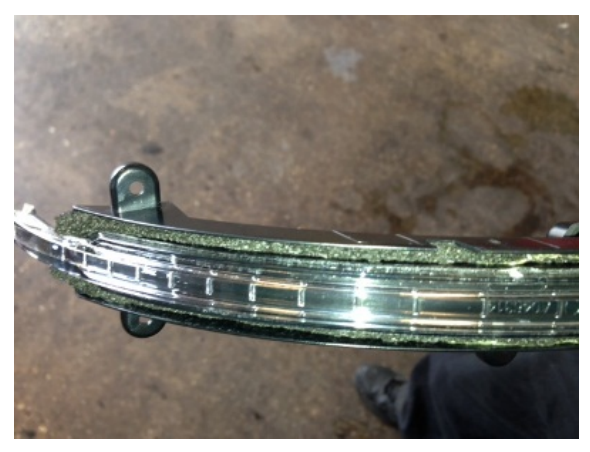
Figure 5. Turn signal lamp with sealing foam tape installed.