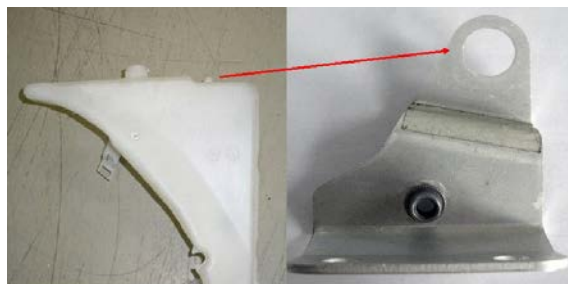
Figure 1. Area of contact between the mounting bracket for the windshield washer reservoir and the washer reservoir.

Excessive free play between the mounting bracket for the windshield washer reservoir and the washer reservoir (Figure 1).