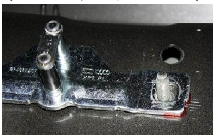
Figure 6. Manual lid style striker plate adjustability and serrated indicators.