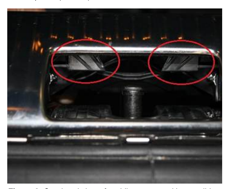
Figure 8. Overhead view of paddles contacted by rear lid latch.

Tip: Moving the striker plate latch towards the front of the vehicle will bring the lid latch closer to actuating the paddle switches (Figure 8).