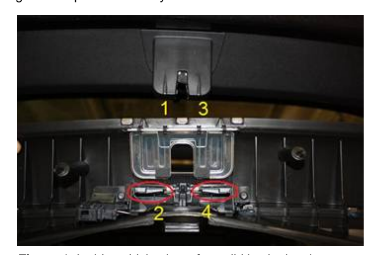
Figure 1. Inside vehicle view of rear lid latch showing location of G526 (2) and G525 (4) on rear sill trim, and contact points (1 and 3).