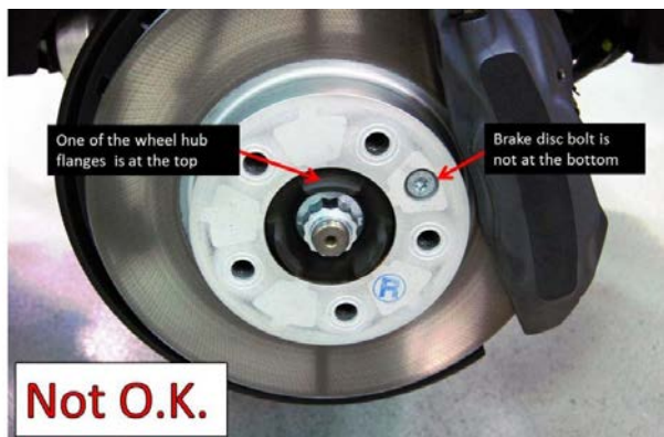
Example of improper positioning.