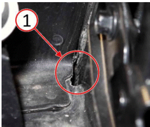
Fig. 4 Verify Metal Tab Is Not Contacting Inner Body Panel