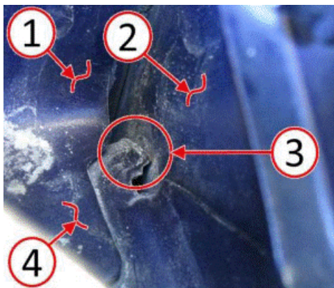
Fig. 2 Close Up Of Contact Area Under The Cowl Panel Cover

Refer to the detailed procedure in ElsaPro> Repair manual> Body> Body Exterior> Exterior Equipment>Removal/Installation> Cowl Panel