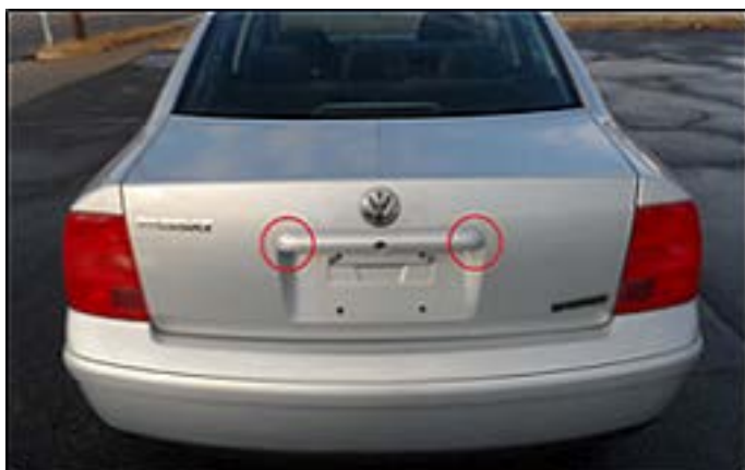
Figure 1 (rear lid handle)

Corrosion where handle contacts rear lid (Figure 1).