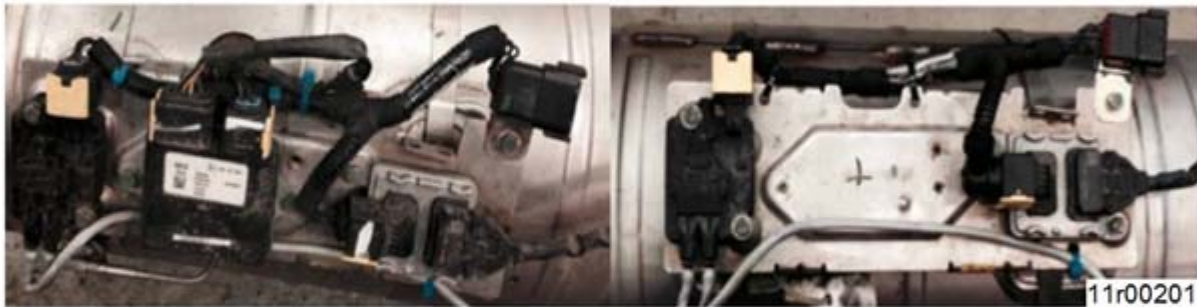
Figure 3, Three Sensor Aftertreatment SCR Wiring Harness (left) and Two Sensor Aftertreatment SCR Wiring Harness(right)