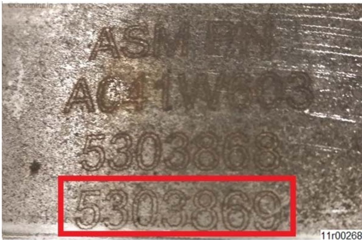
Figure 1, Part Number Location on Aftertreatment SCR Catalyst Canister.