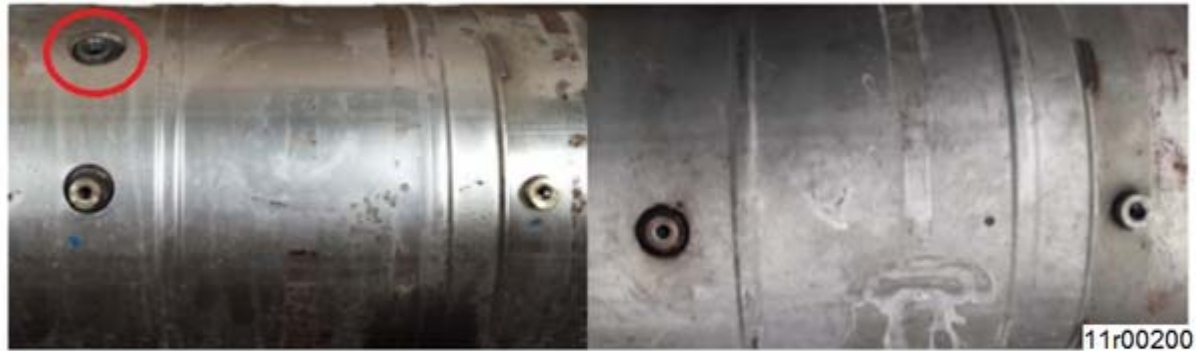
Figure 2, Obsolete SCR Catalyst (left) and New SCR Catalyst (right)