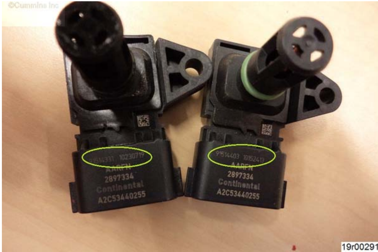
Figure 2, Serial Number Location on the Intake Manifold Pressure/Temperature Sensor.