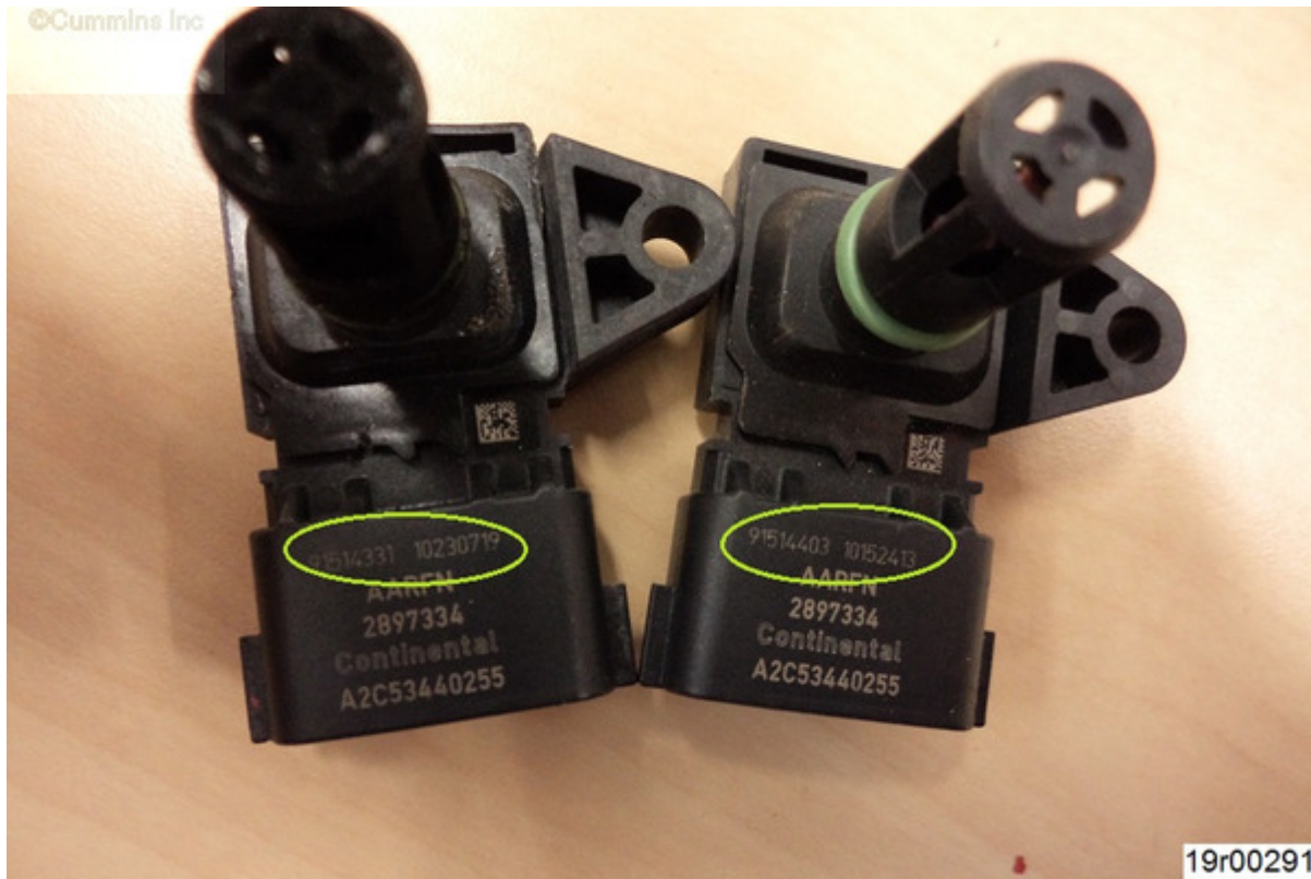
Figure 2, Serial Number Location on the Intake Manifold Pressure/Temperature Sensor.