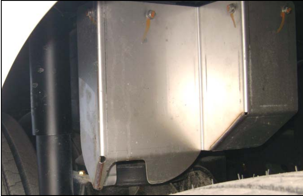
Figure 4. Completed installation of the level sensor guard