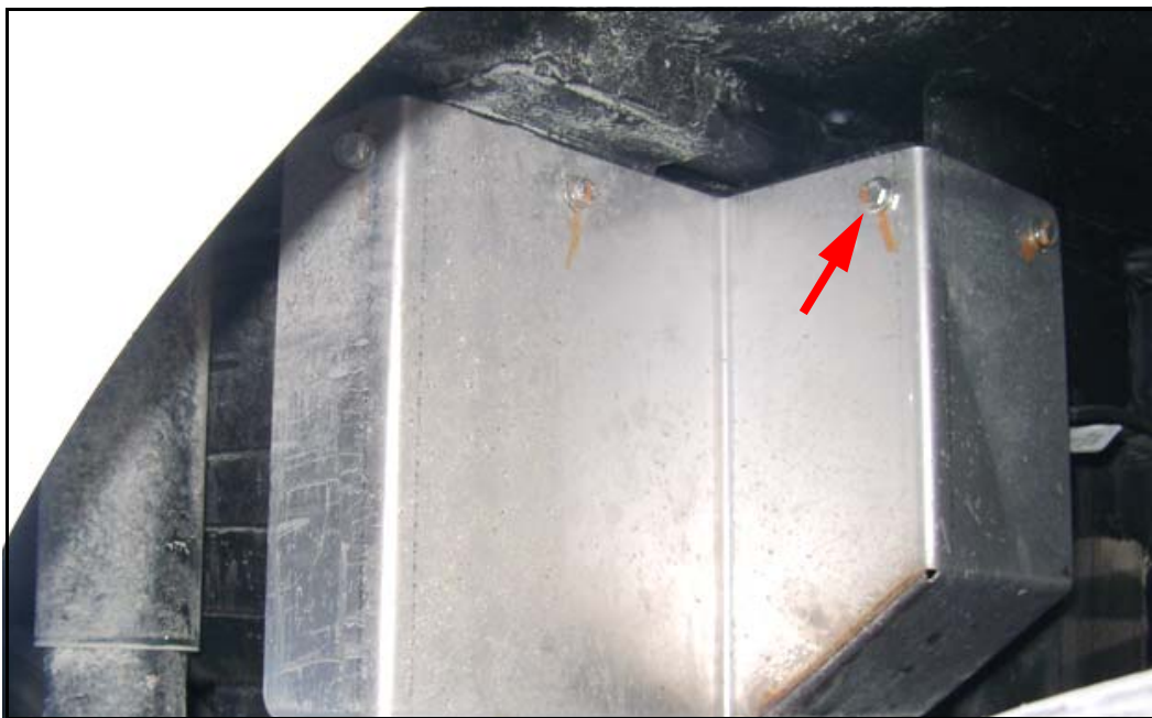
Figure 3. Mounting hardware.