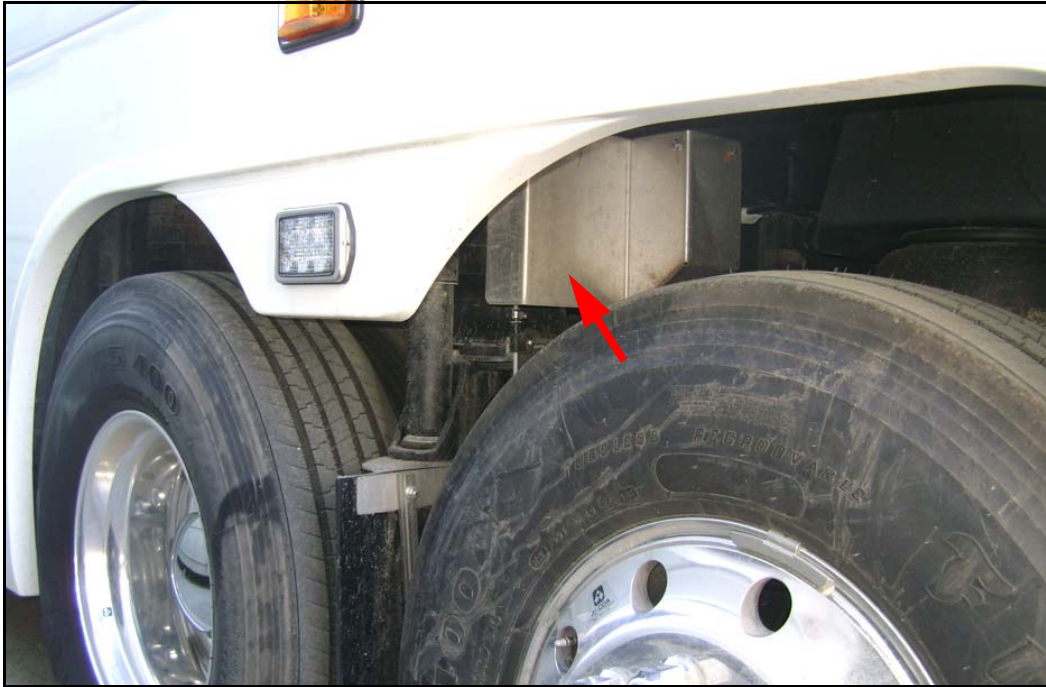
Figure 2. Location of the level sensor guard.