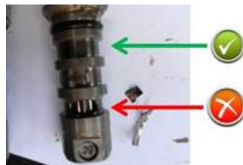
Figure 1. Two top filters are okay, bottom filter is missing.