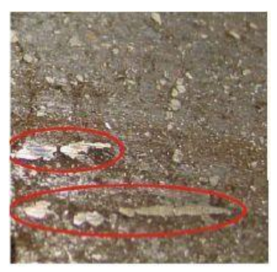
Figure 1. Metallic deposits.