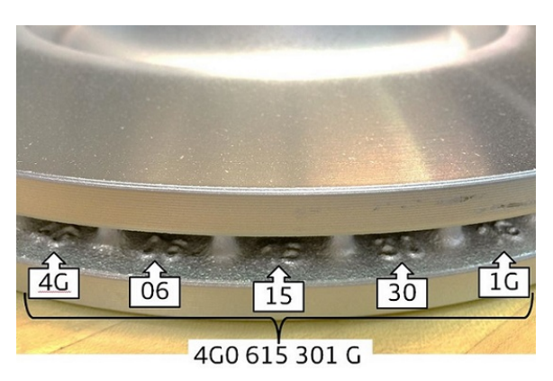
Figure 3. Front brake disc part number location.

Check the part number on the front discs. If part number is not 4G0615301G, install 4G0615301G or 4G0615301Q front discs, or any supersession available in ETKA. (Figure 3).