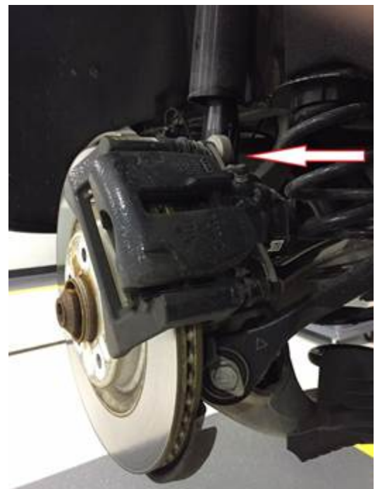
Figure 4. Balance weight position.

The balance weight should be assembled in the upper position near the parking brake electric motor connector (Figure 4).