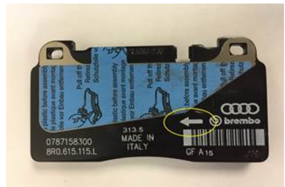
Figure 2. Directional arrow on the back of front brake pad.

The following steps must be followed to ensure proper installation of the pads: