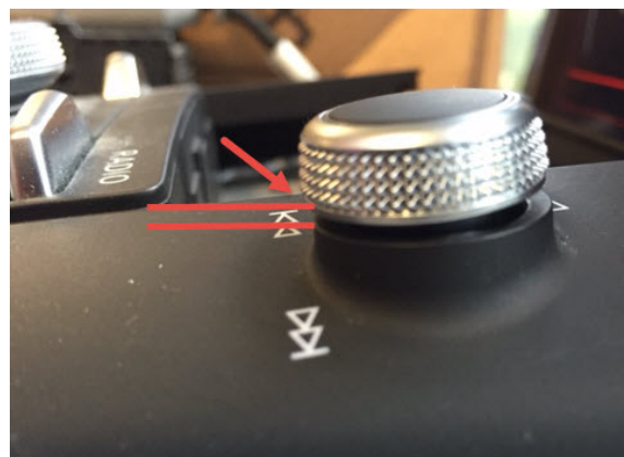
Figure 8. Gap for power function.

After adjusting the knob, if it can still be removed easily, reposition the butyl and install the knob again.