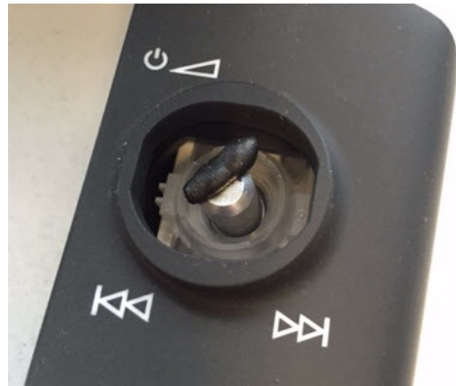
Figure 6. Butyl tape placed over flat edge.