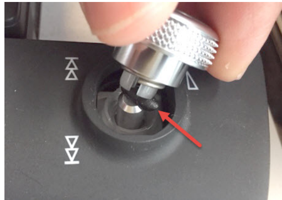
Figure 7. Press knob over butyl back onto metal shaft.