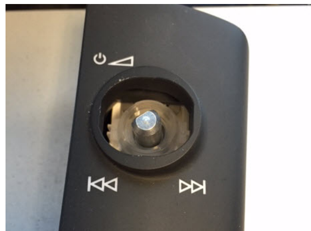
Figure 1. Volume knob missing from control panel.

The volume knob on the MMI control panel is loose or missing because it was separated after being inadvertently caught on a bag or purse strap (Figure 1).