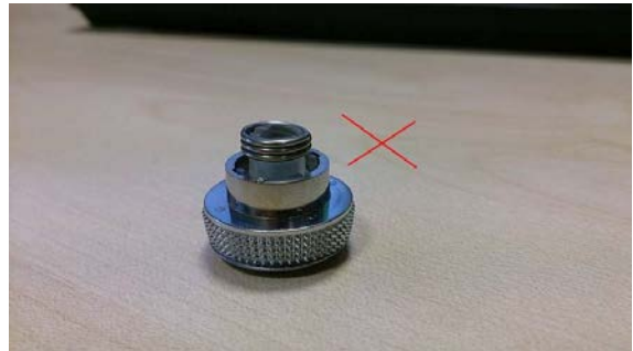
Figure 4. Incorrect position for spring.