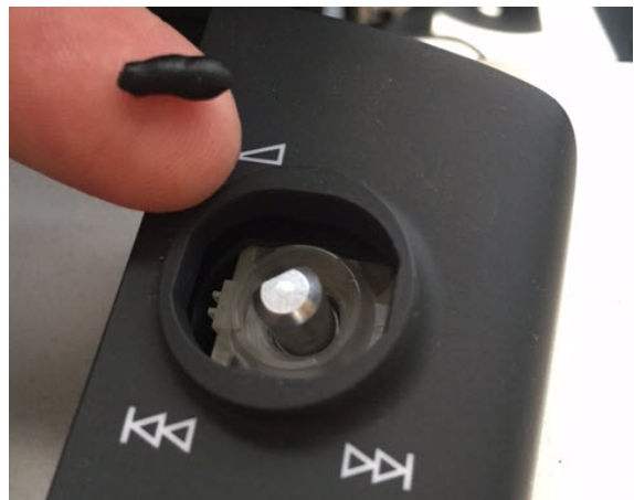
Figure 5. 1/2cm of butyl tape.