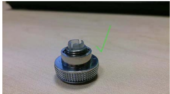
Figure 3. Spring is in correct position.