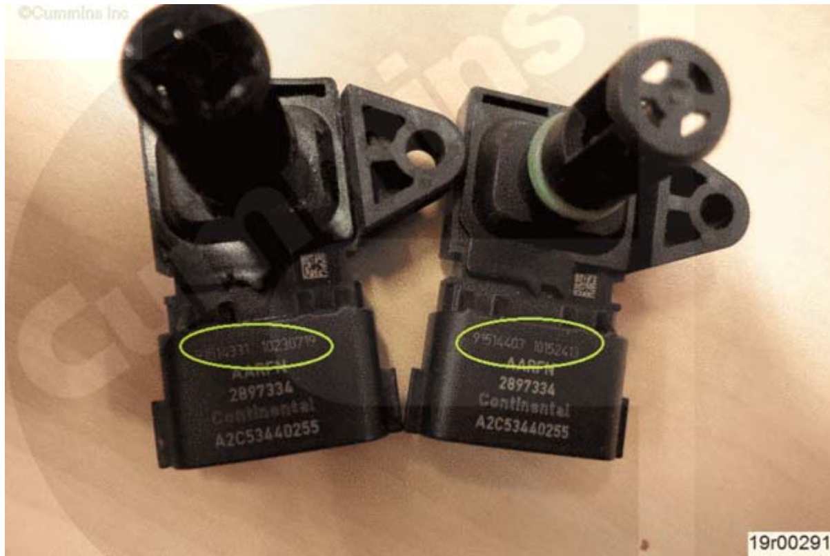
Figure 2, Serial Number Location on Intake Manifold Pressure/Temperature Sensor.