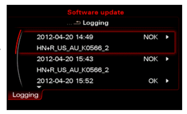
Figure 9. Software update log showing 2 failed attempts before a successful installation.