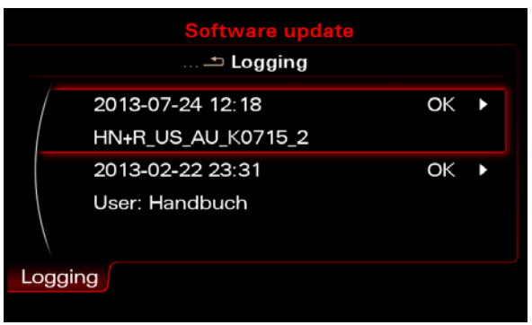
Figure 8. Software update log showing a successful software installation.

Tip: If the update must be performed two or more times due to modules not updating correctly, a screenshot of the software update log is required (Figure 9). This should be kept on-hand for warranty auditing purposes. To take a screenshot, insert an SD Card into slot 1. For A6/A7/A8/Q7, press and hold the left and right arrow keys at the same time. For A4/A5/Q5, press and hold the bottom two softkeys at the same time. All 4 softkeys will flash when the screenshot is taken. A screenshot should be taken of each page in the logging display.