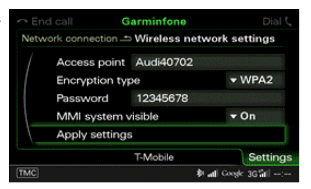
Figure 5. Wireless network settings.