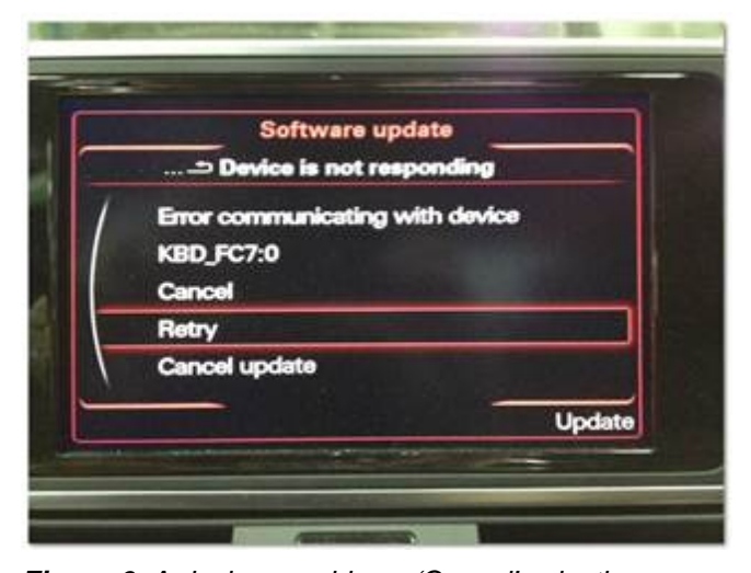
Figure 6. A device requiring a 'Cancel' selection.

Some earlier model year 2012 vehicles, or vehicles equipped with Bose® sound systems may experience certain modules that will not update properly during Step 16 of TSB 2028141. If this should occur, either choose 'Cancel' (Figure 6), or 'Skip device' (Figure 7), depending on the type of error. Do not choose 'Cancel update', as this may cause the software update to fail entirely. After the update is finished and the summary page is shown, select 'Retry' at the bottom of the list if it is available to attempt to update the modules again. If 'Retry' is greyed out, then the software update was successful. Select 'Continue" to proceed. In some cases 'Retry' may have to be repeated two or three times to get all modules to update successfully.