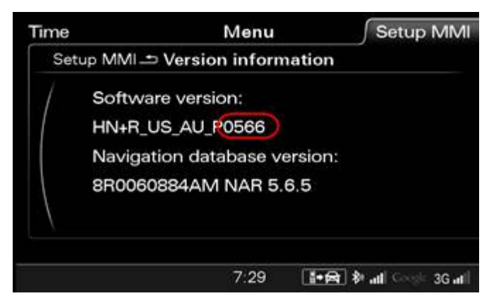
Figure 1. Example showing MMI software version (0566).

Tip: Only apply this bulletin to vehicles if the customer complaint is in the correct group. Applying the update to vehicles outside of the appropriate group can cause repeat repairs and the warranty claim may be denied.