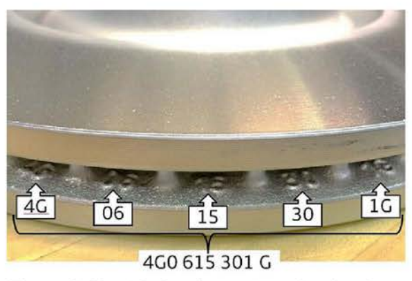
Figure 3. Front brake disc part number location.

Check the part number on the front discs. If part number is not 4G0615301G, install 4G0615301G or 4G0615301Q front discs, or any supersession available in ETKA. (Figure 3).