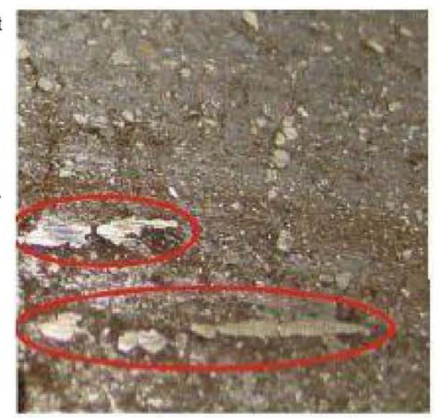
Figure 1. Metallic deposits.