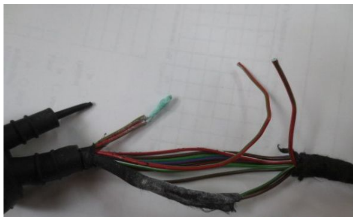
Figure 3. Corrosion of voltage splice X68.