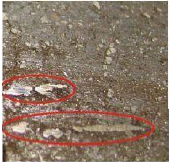
Figure 1. Metallic deposits.