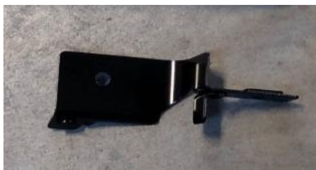
Figure 4 - new bracket assembly.

If the DEF coolant pipe assembly should require replacement, make sure to order all necessary pieces to install the new pipe assembly properly.