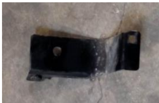
Figure 3 - old bracket assembly.

The new style DEF Coolant Pipe Assembly requires the installation of a new frame bracket (see figures 3 and 4).