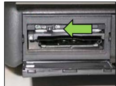
VAS 6150C (Left side behind SC/EX door)