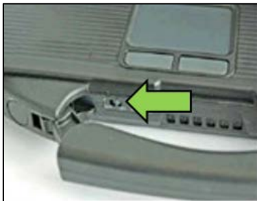
VAS 6150 & VAS 6150A (Front panel behind handle)