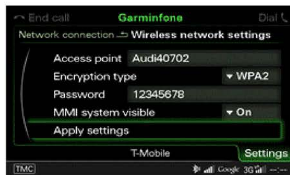
Figure 5. Wireless network settings.

6. As part of the update, wireless settings and paired devices will be deleted. All devices will need to be re-paired after the update, and all wireless settings restored to the customer's settings. To access the Wireless network settings on the MMI (Figure 5), press TEL >> Settings >> Wireless network connection >> Wireless network settings . Record all settings so they can be re-entered at the end of the update.