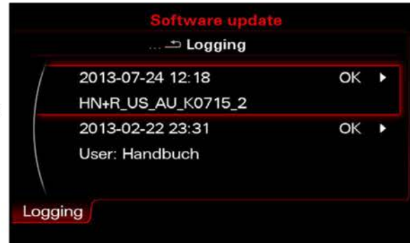
Figure 8. Software update log showing a successful software installation.