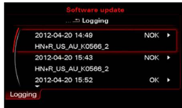
Figure 9. Software update log showing 2 failed attempts before a successful installation.