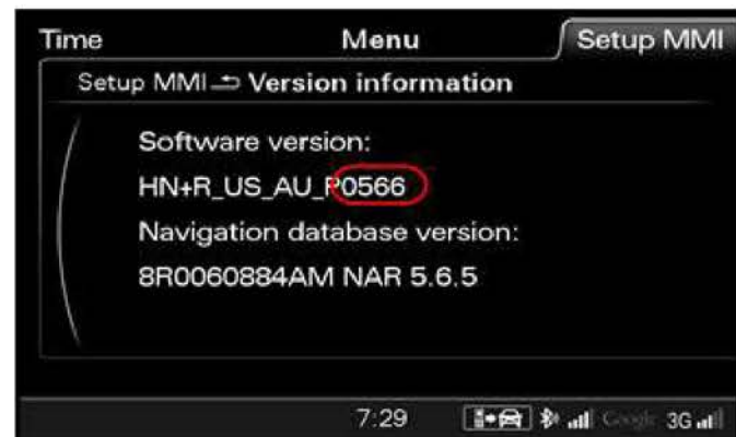
Figure 1. Example showing MMI software version (0566).

This bulletin only applies to vehicles with MMI3G+ Navigation (PR Number "7T6") with or without Audi connect.