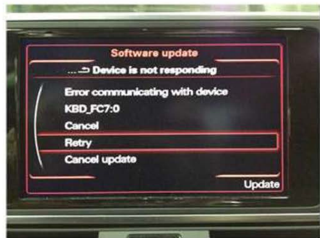
Figure 6. A device requiring a 'Cancel' selection.

Some earlier model year 2012 vehicles, or vehicles equipped with Bose® sound systems may experience certain modules that will not update properly during Step 16 of TSB 2028141. If this should occur, either choose 'Cancel' (Figure 6), or 'Skip device' (Figure 7), depending on the type of error. Do not choose 'Cancel update', as this may cause the software update to fail entirely. After the update is finished and the summary page is shown, select 'Retry' at the bottom of the list if it is available to attempt to update the modules again. If 'Retry' is greyed out, then the software update was successful. Select 'Continue' to proceed. In some cases 'Retry' may have to be repeated two or three times to get all modules to update successfully.